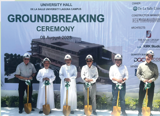
UNIVERSITY HALL Completion Date: 1st Quarter 2025 4 floors