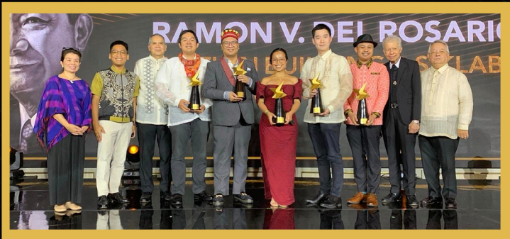
Siklab Awardees 2024

SIX EXCEPTIONAL INDIVIDUALS WERE HONORED AT THE 2024 RAMON V. DEL ROSARIO (RVR) AWARDS ON AUGUST 20 FOR THEIR OUTSTANDING CORPORATE CITIZENSHIP AND FERVENT COMMITMENT TO NATION-BUILDING ACROSS VARIOUS INDUSTRIES.