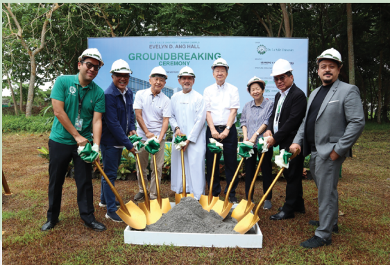
EVELYN D. ANG HALL Completion Date: 3rd Quarter 2025 3 floors + mezzanine