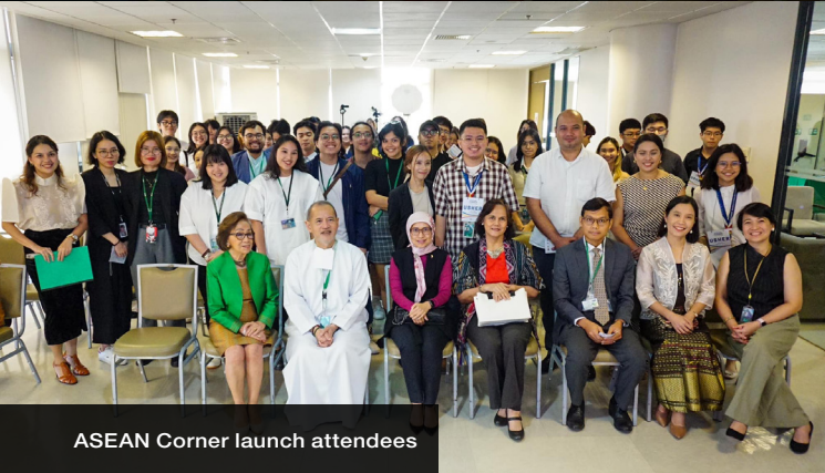
ASEAN Corner launch attendees