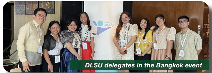
DLSU delegates in the Bangkok event

The group also visited La Salle School Bangkok (Bang Na). The students toured Thai temples and museums for the cultural immersion component of the program. Funding support was provided by the Parents of University Students Organization.