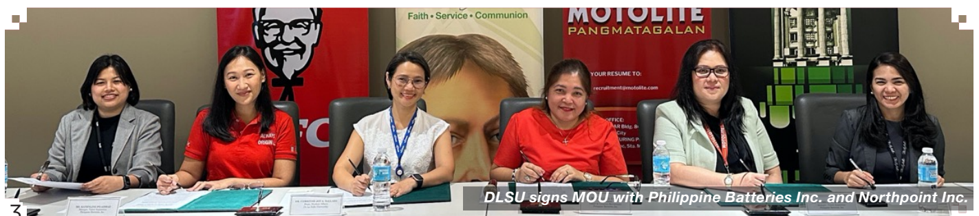
DLSU signs MOU with Philippine Batteries Inc. and Northpoint Inc.