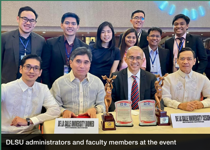
DLSU administrators and faculty members at the event