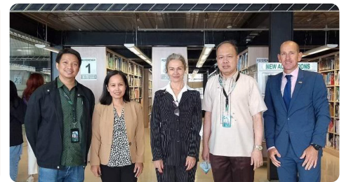
Signatories of the MOU with the Spanish Ministry of Education and Vocational Training