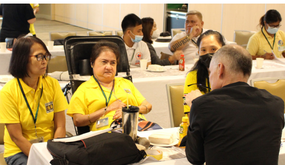
Top photo: TULAY launch attendees