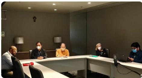
Representatives of DLSU and HEAD Foundation promote areas for collaboration on education