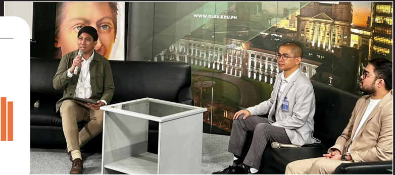
DLSU FACULTY RESEARCHERS AT THE EVENT