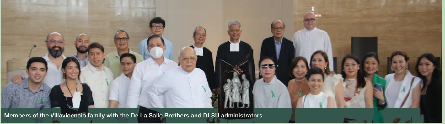
Members of the Villavicencio family with the De La Salle Brothers and DLSU administrators

Conceptualized in 2011, constructed during the tercentenary celebration of the death of St. John Baptist de La Salle in 2019, and consecrated in 2022, the sanctuary serves as a repository of the Founder’s relic and opens its doors as a pilgrimage site for educators. The sanctuary’s overall design and concept came from the architectural firm CAZA, inspired by the Lasallian Star of Faith—the Signum Fidei.