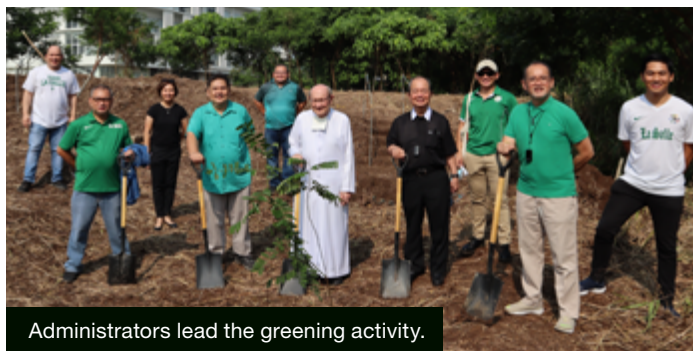
Administrators lead the greening activity.

After the ceremony, the group had an ocular of the Shrine of St. John Baptist De La Salle, which is nearing completion. They also visited other infrastructure projects under construction.