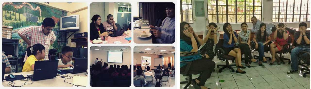
The action research team orients public school students and teachers on e-Learning.

AN ACTION RESEARCH OUTREACH PROGRAM FOR PUBLIC SCHOOLS BY A TEAM OF FACULTY MEMBERS FROM DE LA SALLE UNIVERSITY PRESENTS lessons and critical action plans for e-learning in the country.