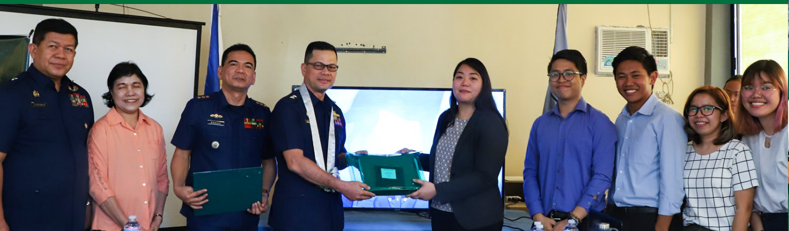
Faculty and students hand over the K9 Management Information System to Philippine Coast Guard (PCG) K9 Force.

The community is enjoined to pause every 5 pm to remember the front liners who are courageously responding to the call of duty and to pray the Lasallian Prayers.