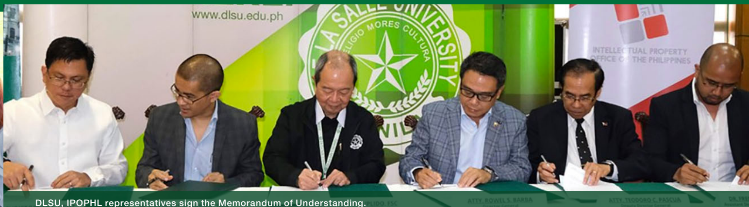
DLSU, IPOPHL representatives sign the Memorandum of Understanding.

For more information, call 665. Or email: clinic@dlsu.edu.ph