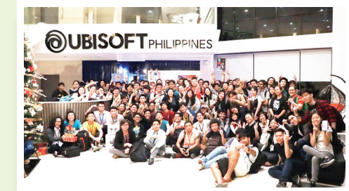
Portfolio day participants

A separate closed-door session was held for those who wanted to have artworks critiqued.