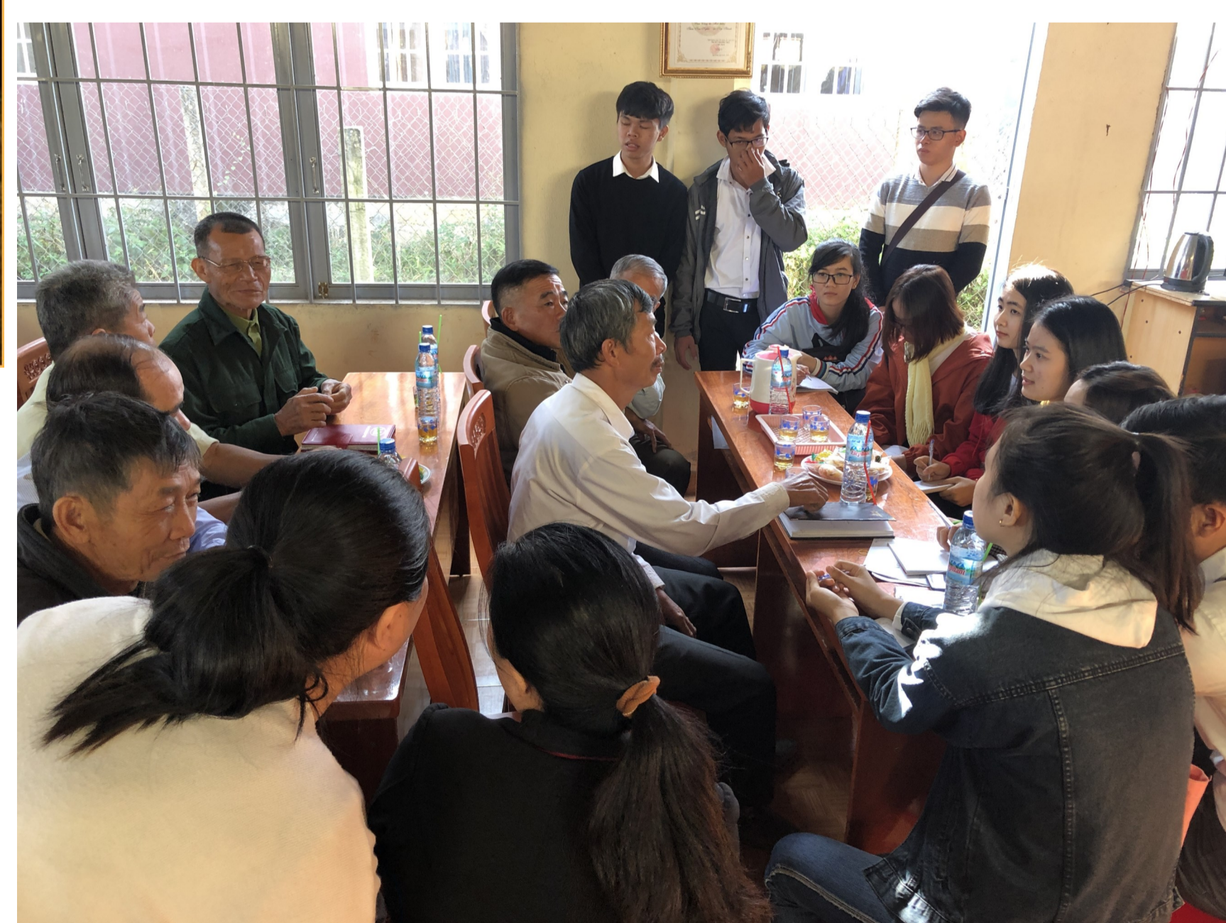
Study with community