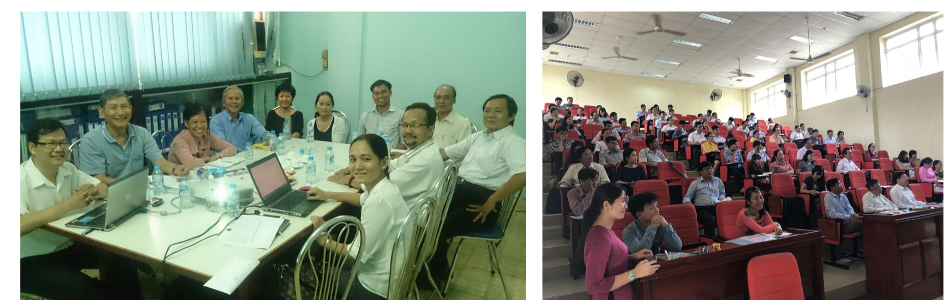
Workshops on Program revision