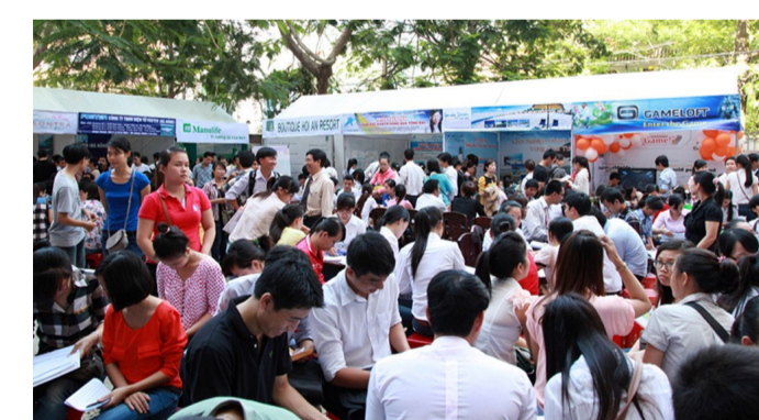
Annual Job fair