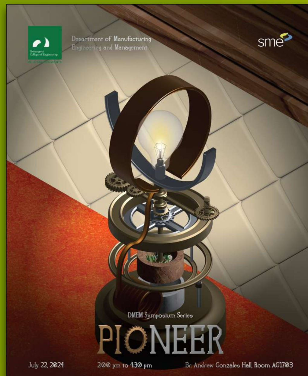
DMEM Symposium Series