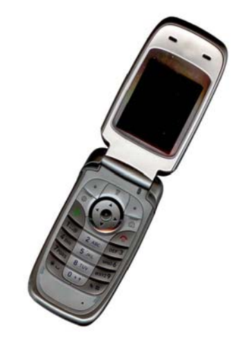
Fig. 3 Example of an image with acceptable resolution