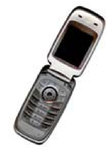
Fig. 2 Example of an unacceptable low-resolution image

must be placed after their associated figures, as shown in Fig. 1.