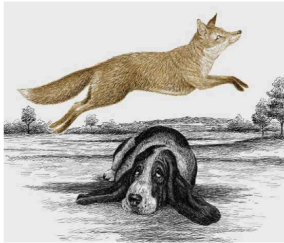
Figure 1. The First Figure