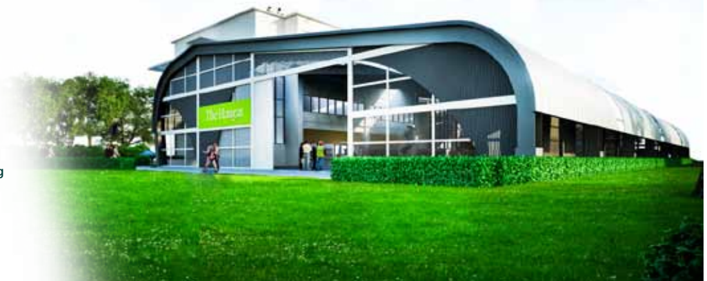
The Richard L. Lee Engineering and Technology Block

Featuring an innovative design, the hangar will contain instructional and research laboratories serving the needs of the Gokongwei College of Engineering, College of Computer Studies, and College of Science. The construction has been scheduled for completion in the summer of 2015.