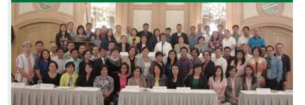
The multi-sectoral participants of the Endorsement Workshop.

In partnership with the Environmental Management Bureau (EMB) and the United Nations Industrial Development Organization (UNIDO), De La Salle University recently organized a multi-