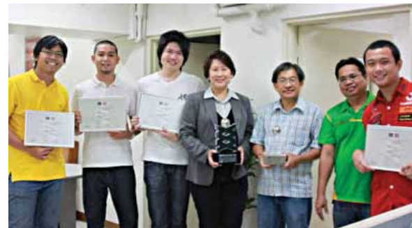
The Student Excellence Award includes the Emerson Cup trophy for the University, USD1,000, and individual plaque for students.

FOR THEIR RESEARCH PROJECT focusing on the performance of solar chimney with built-in phase change material to enhance a room's natural ventilation, a group of students won the Student Excellence Award Engineering Category of the 2010 Emerson Cup.