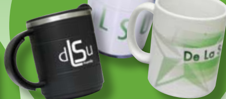
Aluminum mug (P280), tumbler (P245), and ceramic mug (P120) are still available at MCO. For orders, call Virgie at local 144.