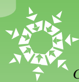
Graphic logo tees for men and women (P280). Available at MCO.