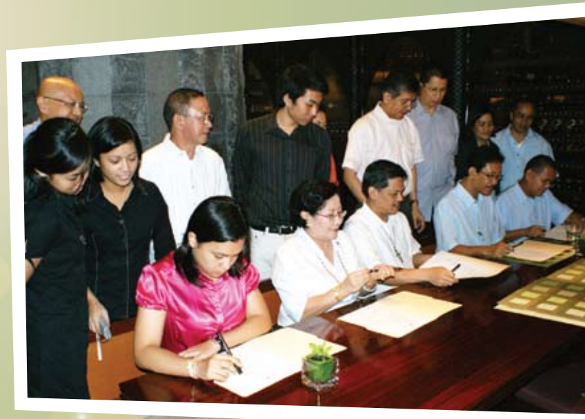
MSCB representatives sign the Memorandum of Agreement on tuition increase for next school year.