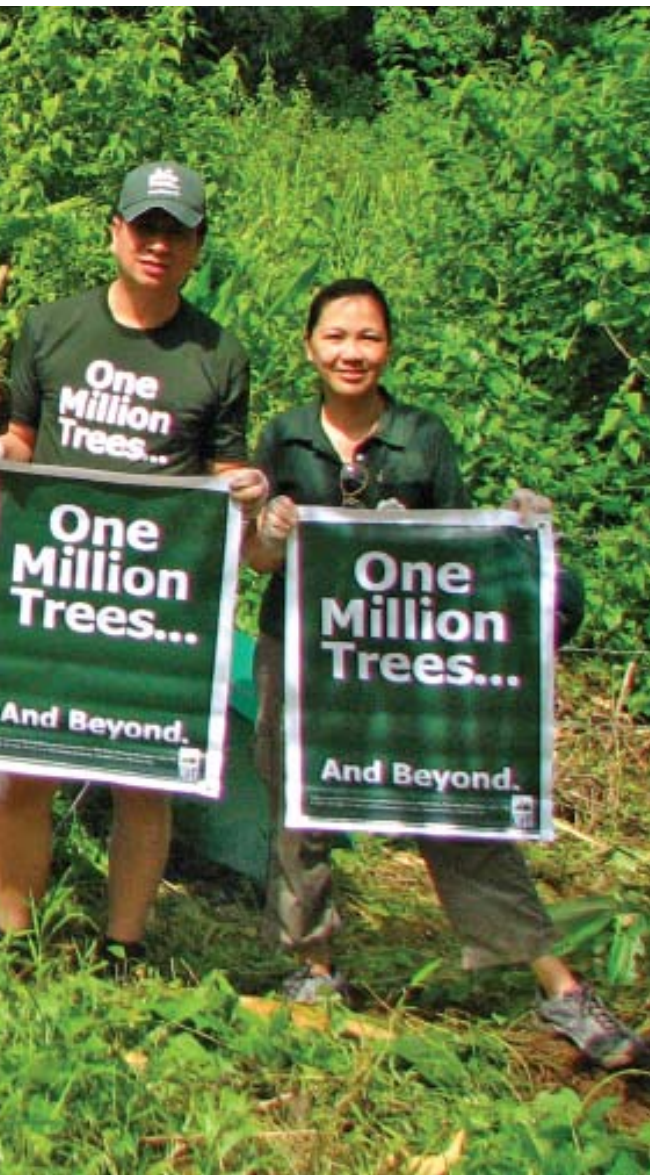
Left: DLSU-PUSO members show support for DLSP's "One Million Trees and Beyond" project.