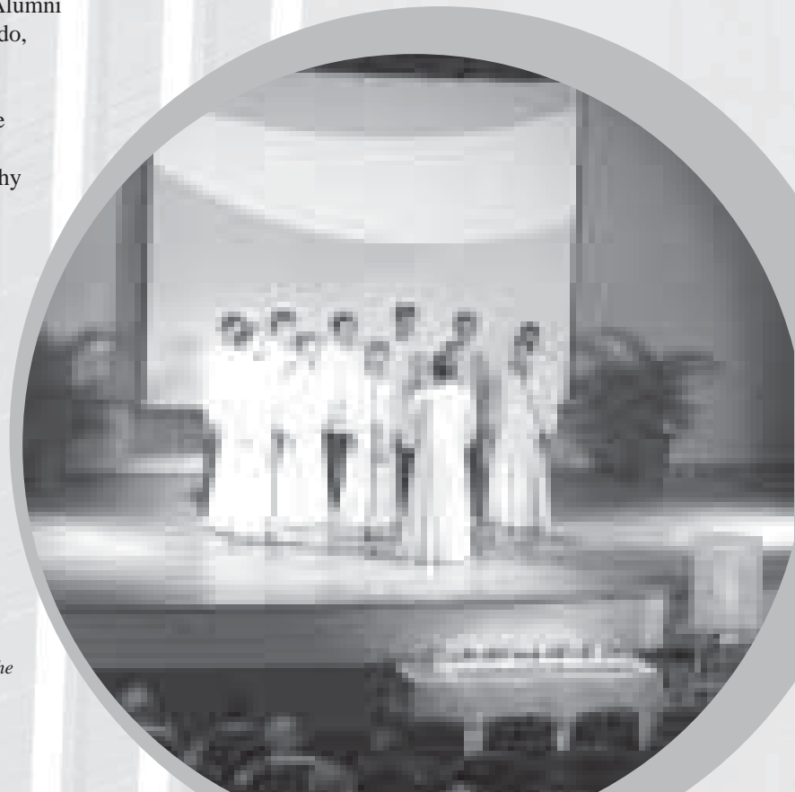
The DLSU Chorale performs at the Natividad Fajardo-Rosario Gonzalez Auditorium during the launching of the Br. Andrew Gonzalez Hall.