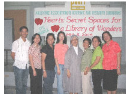
PAARL Board 2006

April 6, 2006 was a red letter day to more than 100 librarians who attended the public forum on “Hearts: Secret Spaces for a Library of Wonders” at St. Paul University, Manila.