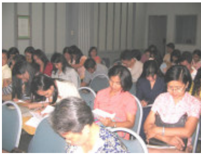
Participants in full concentration