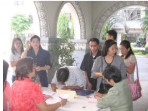
Registration for the forum