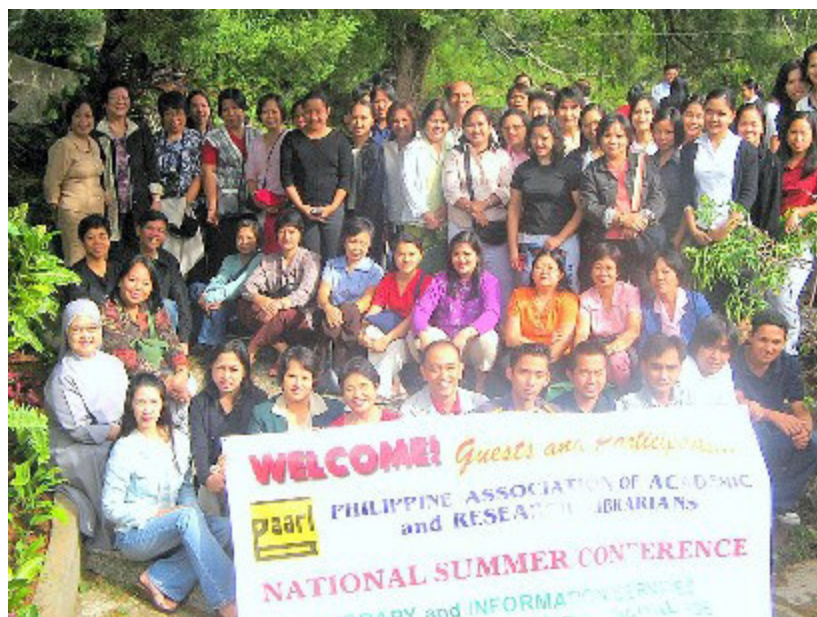
Participants to the conference held at St. Paul in La Trinidad, Benguet

The Conference was geared towards redefining our library agenda for the future, taking into consideration the challenges of innovation and technology, creating a training environment focused on innovative approaches in library services, strengthening current awareness in information access, library security and safety, and other immediate concerns.